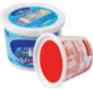
Plastic Tubs #1-7